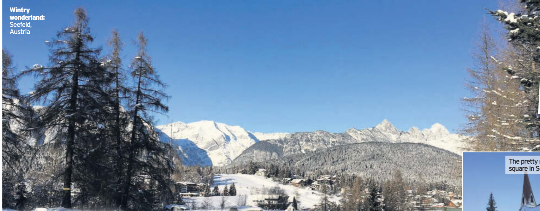
Wintry wonderland: Seefeld, Austria

GO ALL INCLUSIVE IN JAMAICA TUI offers seven-night holidays to Jamaica, staying at the Platinum 4T Riu Montego Bay on an all-inclusive basis. Prices, including transfers, from £963 per person when booked online based on two adults sharing and including flights departing from London Gatwick on January 31. To book go to tui.co.uk , visit a TUI store or download its app.