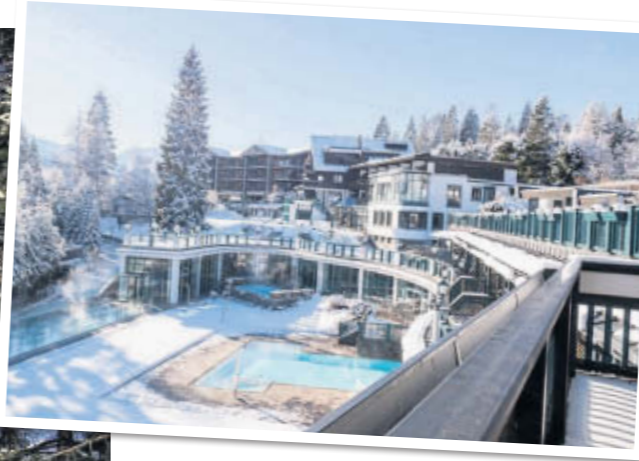
The Astoria resort boasts a host of spa features including treatment rooms and outdoor pools