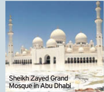
Sheikh Zayed Grand Mosque in Abu Dhabi

We select our pick of destinations on offer from travel agents